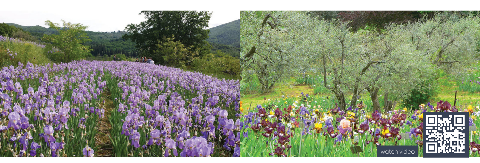
Iris cultivation could be an innovative solution for the production of product for medical and cosmetic sectors. Gianni Pruneti

reason, the Italian cultivation of medicinal plants is often adopted in hill or mountain areas, in limited areas and on land not suited to other more profitable crops. Iris is known and appreciated since ancient times for the properties of its dried rhizomes. For centuries, Iris has been used both in the medical and cosmetic sectors: as a remedy against coughs, against snake bites and depression, for perfumes, powders, soaps and pigments.